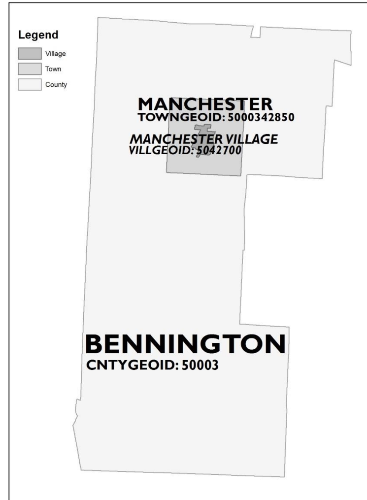
Figure 1a. (left) Diagram depicting hierarchy of Census-defined geographic areas. 1b. (right) Example geographic boundaries (Village, Town, and County) containing Manchester Village, with corresponding GEOID codes as enumerated in this standard.